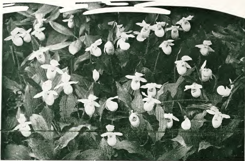
Cypripedium spectabile . See page 6